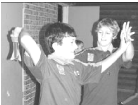
Castle Hill Joeys and Cubs enjoying their SOUND night