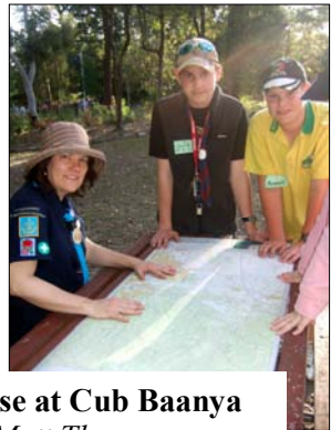
Map and Compass Base at Cub Baanya