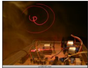
Laser light show