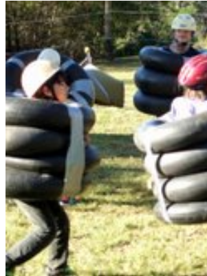
Thrills and spills at the GWSR Jamboree