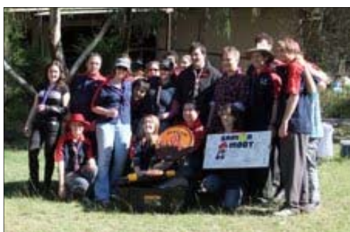
Members of Kings Langley Rover Crew who organised and ran the successful Gamer Moot

Members of 1st /2nd Merrylands Rover Crew who won the Gamer Moot trophy and the privilege of running next year's Region Moot.