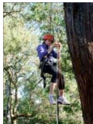
Scout Prussiking at the recent Big Day In