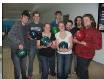
Rovers at the recent Balls of Steel 10 pin bowling night