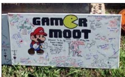
The Moot Trophies

On the first full weekend of August up at Camp Ku-ring-gai, the 2010 Gamer Moot was a success for the Kings Langley Rover Crew with over one hundred Rover Scouts attending the weekend - long funfest of life-sized Mario Karting, oversized Jenga playing and much, much more. During the weekend there was a wide variety of activities, games and competitions for participating Rover Scouts to take part in, including a themed dinner night (dressing up as computer game characters or game console parts, including one Rover who dressed as a Wii™ Remote), various round-robin games and activities. A massive congratulations to the members of the 1 st /2 nd Merrylands Rover Crew for topping the high score Leaderboard for this year's Moot. So what will they come up with for next year's Region Moot?