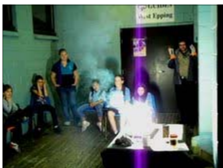
Girl Guides enjoying a fun Chemistry night

A call from Roselea Joey Leaders had us put on a Chemistry night for them. Their hall also has a separate room for the local Guides, and they happen to meet on the same night as the Joeys, so we presented a chemistry night for the Guides after the Joeys. I'm not sure what the Leaders made of our program, but the girls voted with their voices and feet chanting "do it again" - of course we never do!