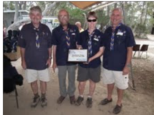
BEST ACTIVITY BASE WARATAH 2010