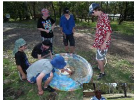
HAVING FUN ON THE BASES @ WARATAH 2010