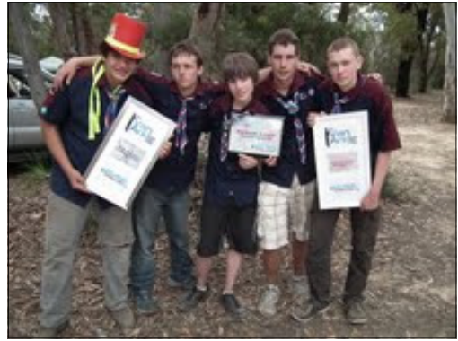
THE NIGERIAN PANDA CONFEDERACY 1ST EMU PLAINS