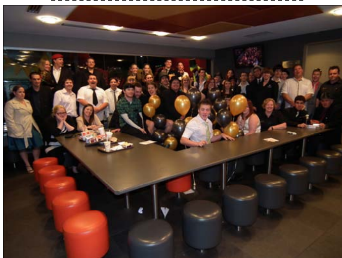
The Rovers pose for a group photo.