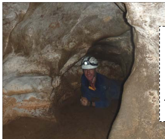
Dingo emerging from a cave!

Email: activities@greaterwestscouts.com.au