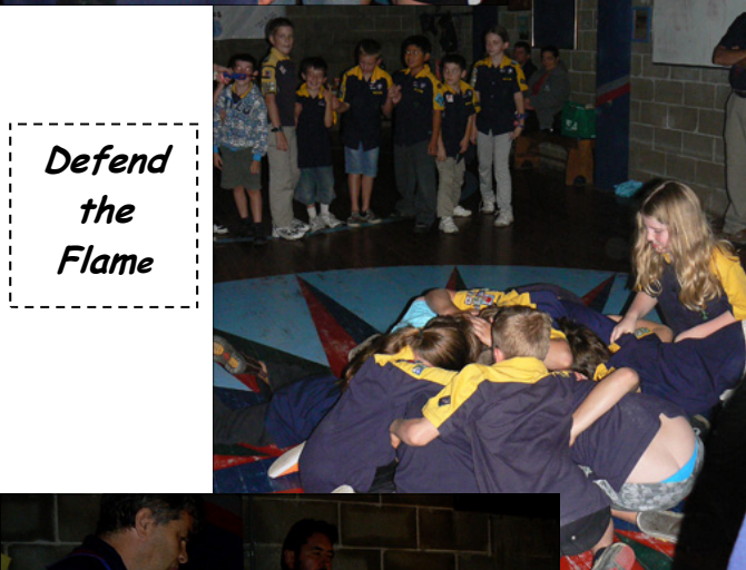
Defend the Flame