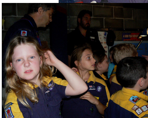
Quakers Hill/ Doonside Cubs