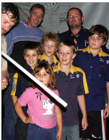
Tiga appears in mid air !