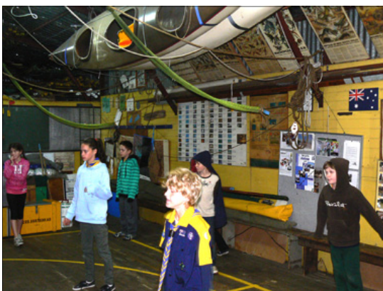
Northmead Cub Scouts

Returning to Groups is always encouraging, and this month it was to Scouts at Whalan and Oakville for separate SOUND nights.