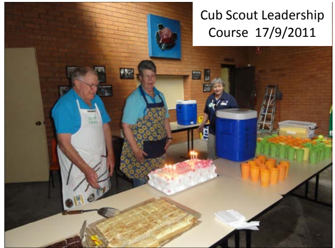
Cub Scout Leadership Course 17/9/2011