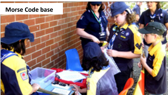
Morse Code base