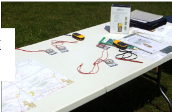
Mapping Compass & GPS

Northmead had a radio and computers running, as well as a table of electrical things to investigate. A large cargo net slung up in the centre of the hall, neatly contained Cubs who tumbled around over head.