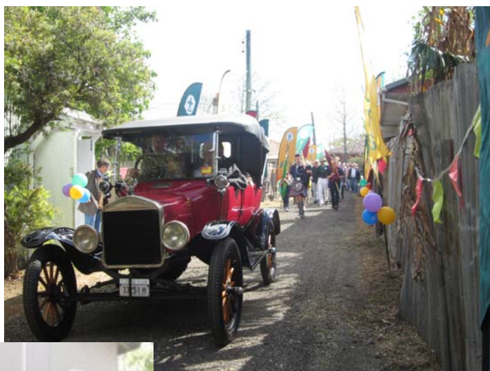
Piper Riordan Drake Venturer Scout 1st Springwood led the parade, which followed four vintage cars carrying some of the most senior past members.