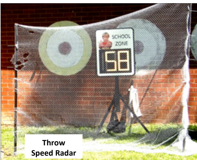
Throw Speed Radar