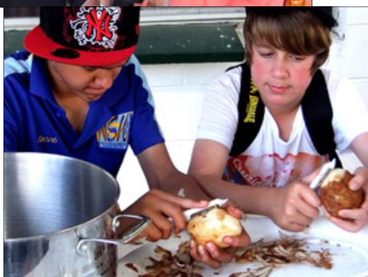
Kitchen Duties !