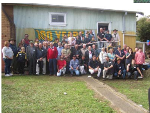
Current and past Scouts pose for a Group photo in the traditional position for photos from 1925 onwards.