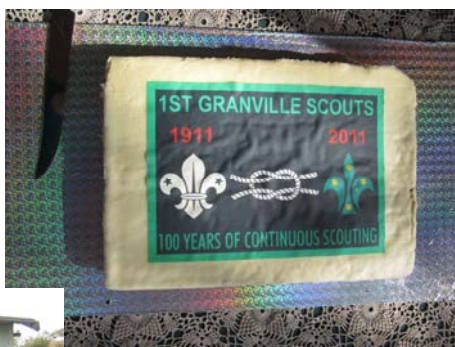
The Centenary cake with matching badge design.