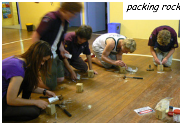
Winston Hills Venturers packing rockets

all except one, which refused to go play in the sky with the others!