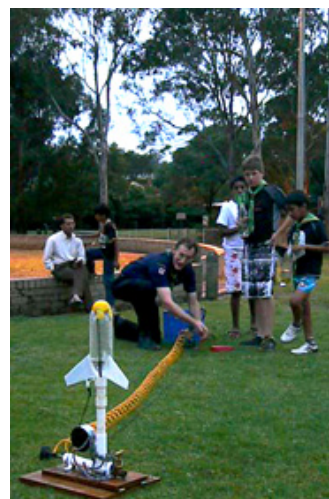
Setting up the water rockets with 1st Pendle Hill Scouts

Pendle Hill Scouts, on the last night of the year, launched Water Rockets in the small park near their hall. There were quiet a few families present, and the bravest young kids were encouraged to join the Cubs pumping the rocket, and watch it zoom high in the sky. This was our first activity night with this Group and we were invited back this year to do other programs with them.