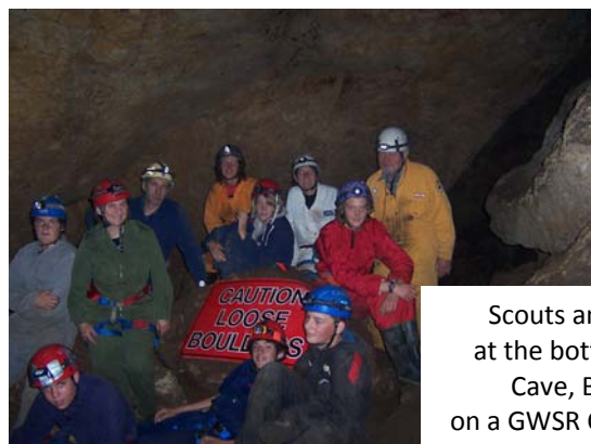
Scouts and Leaders at the bottom of Grill Cave, Bungonia on a GWSR Caving Course