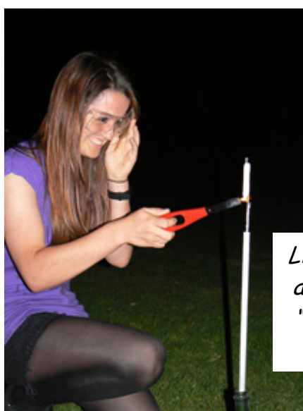
Lighting a rocket at Winston Hills "What did I get myself into?"

Pendle Hill Scouts, on the last night of the year, launched Water Rockets in the small park near their hall. There were quiet a few families present, and the bravest young kids were encouraged to join the Cubs pumping the rocket, and watch it zoom high in the sky. This was our first activity night with this Group and we were invited back this year to do other programs with them.