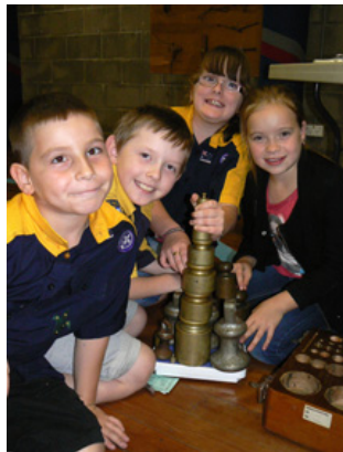
Dural Registration Day