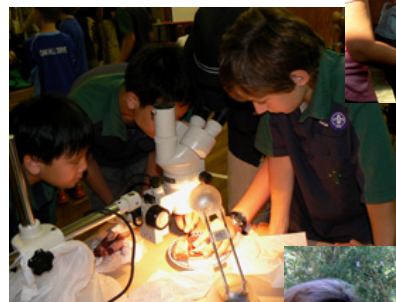
Robot-Crane 1st/2nd Blacktown Cub Scouts →