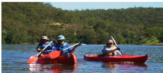
Just a perfect day on the water at Wisemans.