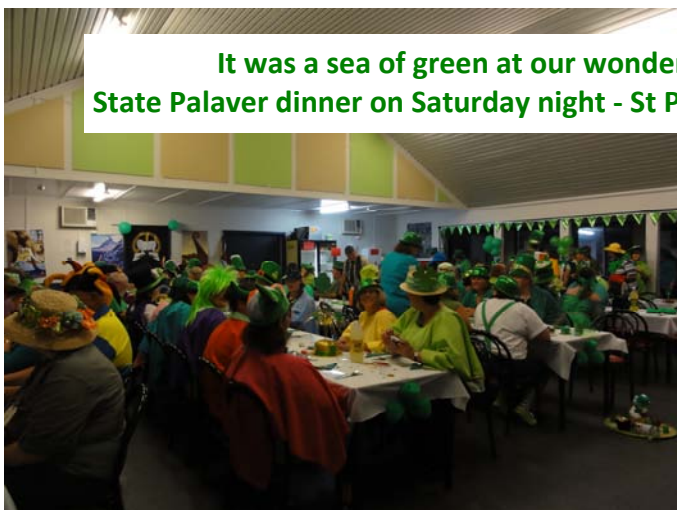
It was a sea of green at our wonderful State Palaver dinner on Saturday night - St Patrick's Day!

Spread the word to all of your Scouting friends in Australia and overseas. International participants are welcome in 2012.