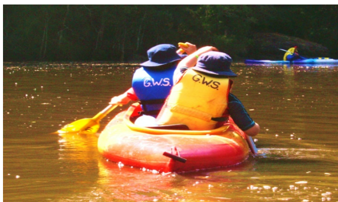
Scouts from 2 nd Castle Hill getting into the swing of paddling.

Next month I am participating in caving weekend at Wee Jasper which will be a huge course. No doubt there will be some great stories to hear and tell from that.