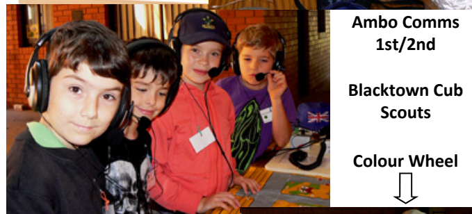
Ambo Comms 1st/2nd