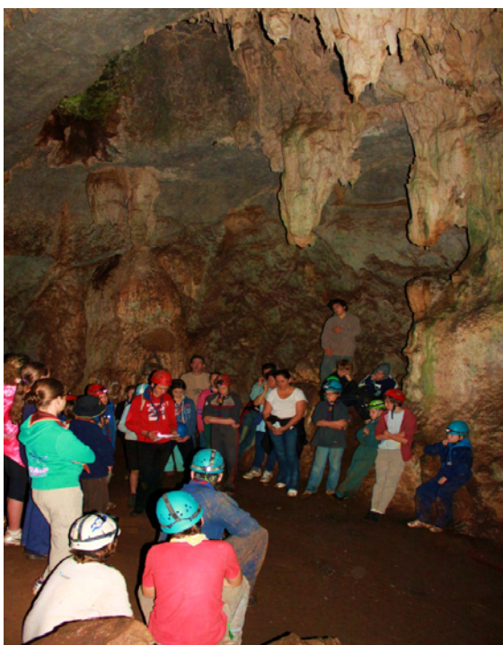
Scouts sharing together in a Scouts Own at Wee Jasper