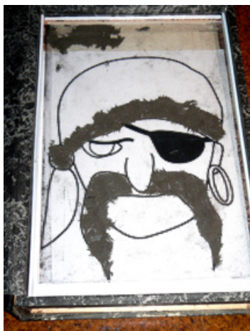
Magnetic Beard Paint

Painting with a magnet is novel and non-intuitive, and requires experimenting and responding to visual and tactile feedback (the 'brush' can be felt to pull to the iron filings), so I think it will appeal to Joeys and Cubs.