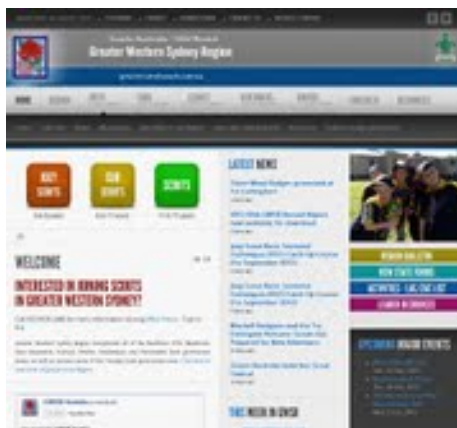
The new site home page screenshot

PS. Are you on Facebook? If so, then please search for 'GWSR Scouts' and 'like' us - or go to: https://www.facebook.com/gws.scouts