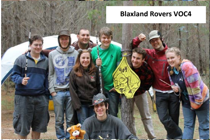
Blaxland Rovers VOC4