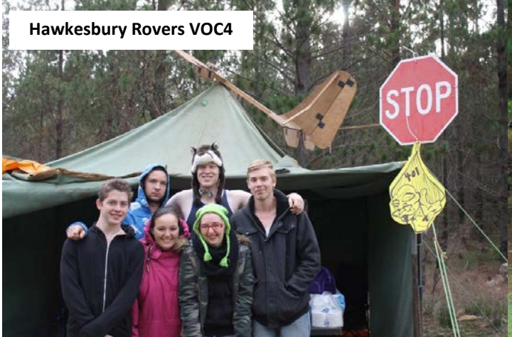
Hawkesbury Rovers VOC4