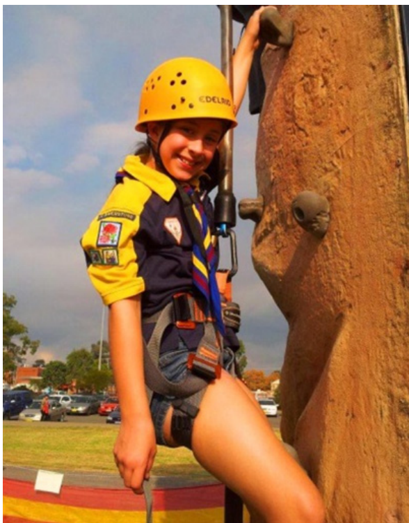
A Cub Scout tackles the climbing wall.

Email: activities@greaterwestcouts.com.au