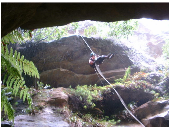
GWSR Venturer in Yileen Canyon