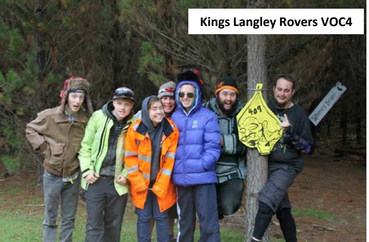
Kings Langley Rovers VOC4