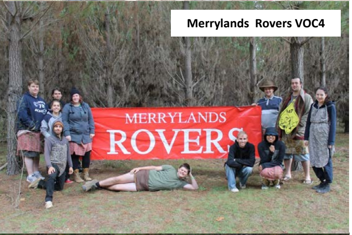
Merrylands Rovers VOC4