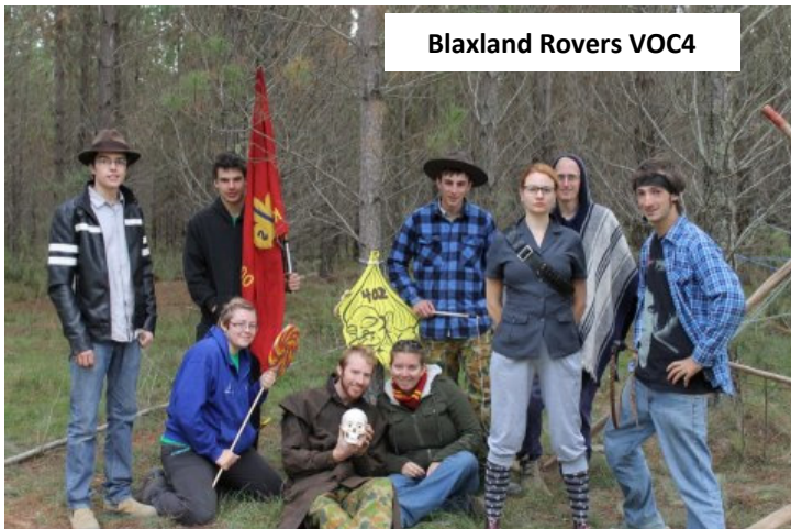
Blaxland Rovers VOC4