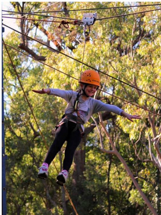
"Hey Mum! Watch me fly"!