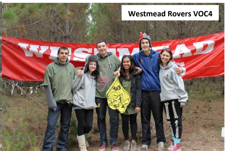
Westmead Rovers VOC4