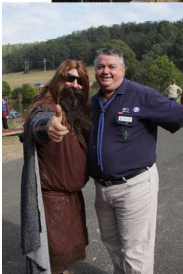
The strange people you meet at Jamborette!