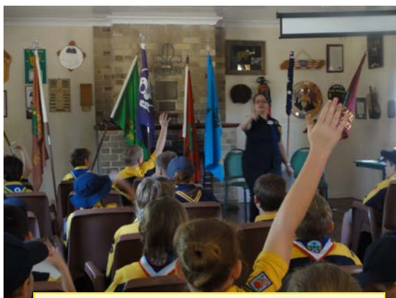
Sessions were conducted both indoors and outside in the shade.

Our CS Leadership course was held at Bundilla on September 7. We had 49 very enthusiastic and polite Cub Scouts on course. My thanks to my District CS Leaders and their helpers for running the sessions and activities and for helping with the clean up at the end of the long day. A big thank you also to the members of the Blue Mts Scout Fellowship who catered for all of us - the evening baked dinner was delicious.