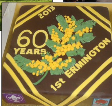
The beautiful cake created by Josie Botto