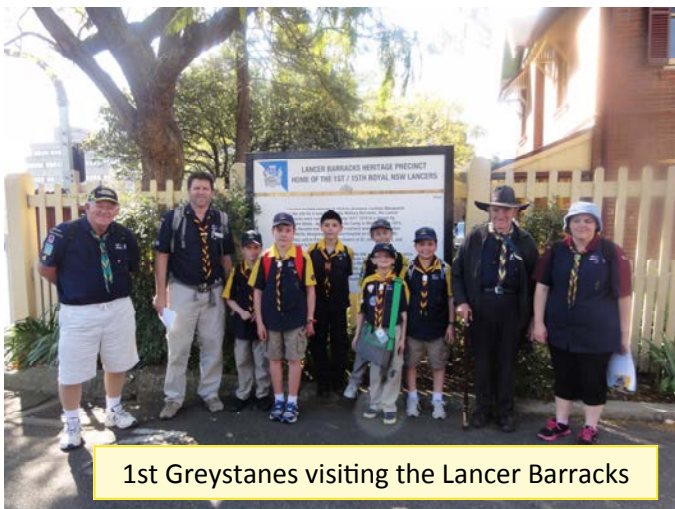
1st Greystanes visiting the Lancer Barracks

Such a busy time for the Cub Scout section! 203 Cubs and 81 Leaders and supporters took part in the Region Cub Scout Outing . It was a glorious day and I think everyone came away a little more informed about historical Parramatta. My thanks to everyone who helped on the day and to all the participants.