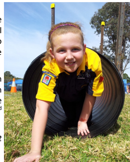
A young cub from 1 st St Marys enjoying the challenge of the 'maze'.

Email: activities@greaterwestcouts.com.au