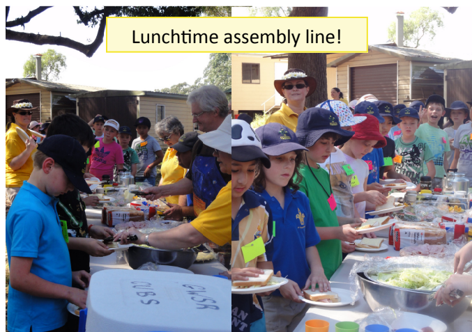
Lunchtime assembly line!

The Pack Coordinators are busy organising their packs for Cuboree and contacting Groups for items they will need, such as tents, dining flys and kitchen gear. CSLs are busy with camps and training their Cubs to deal with camp living for four days. Hopefully many of our Cubs will attempt the Campout Badge during the school holidays - this will help them to gain some insight into living out of a suitcase, washing up and finding their way in the dark with a torch!