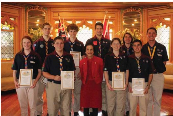
Queen's Scout Award Presentation at Government House