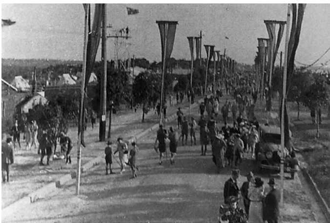
Scouts walking along Bradfield Road 1938