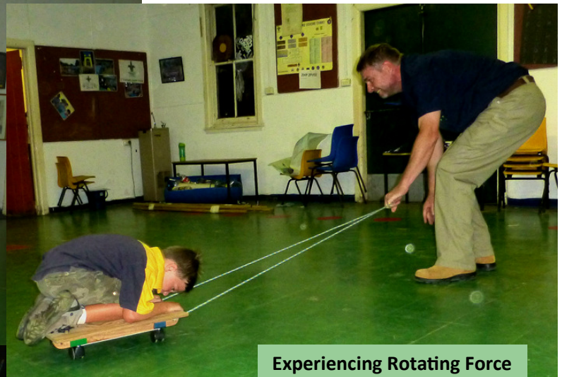
Experiencing Rotating Force