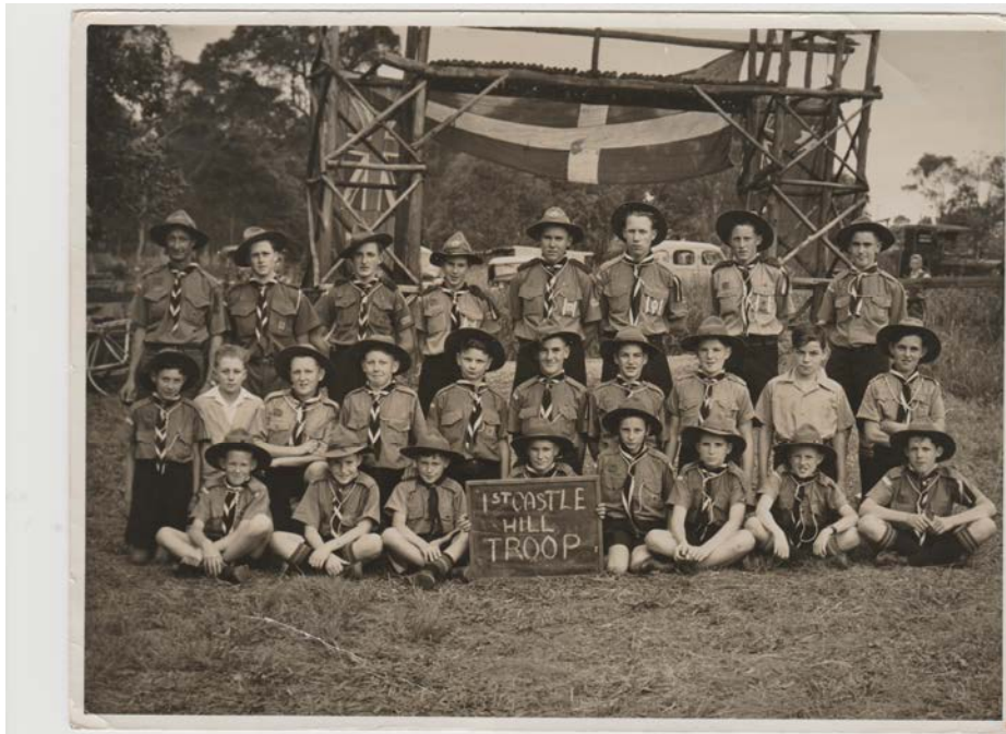
1st Castle Hill Troop 1949/1950

We have a Facebook group for the upcoming centenary which will announce more information as the day approaches. Please use this link to join the group https://www.facebook.com/groups/1560880024173247/