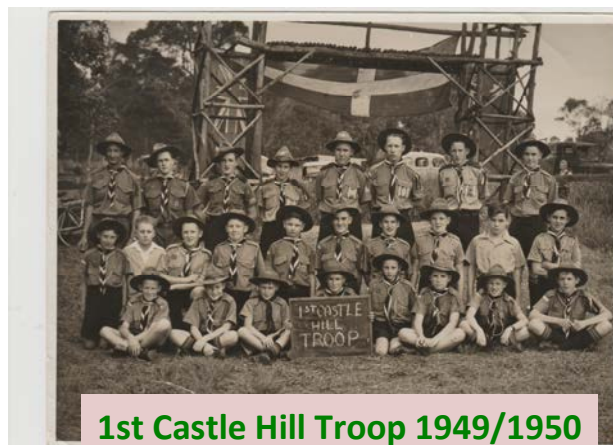
1st Castle Hill Troop 1949/1950

Email: hourd@bigpond.com or mobile: 0418 228 173