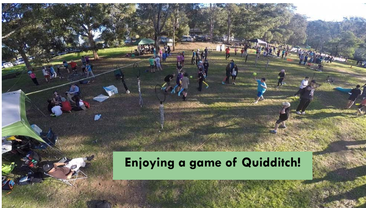
Enjoying a game of Quidditch!