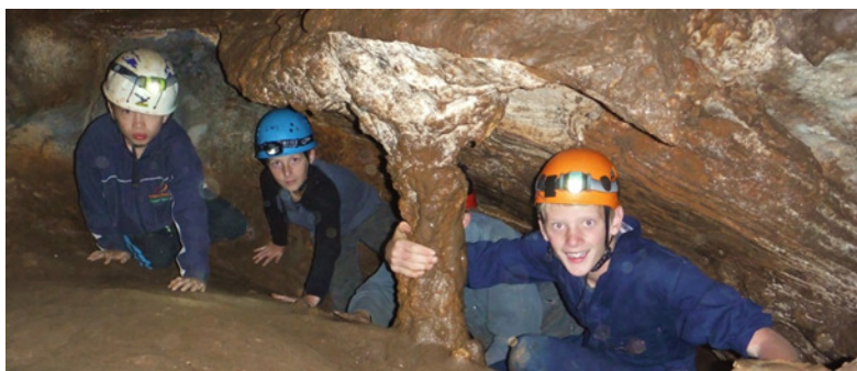
Some intrepid Scouts checking out the landscape, somewhere down a hole at Wee Jasper.