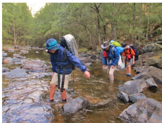
No time to pose for a photo. It's all eyes on the task ahead!