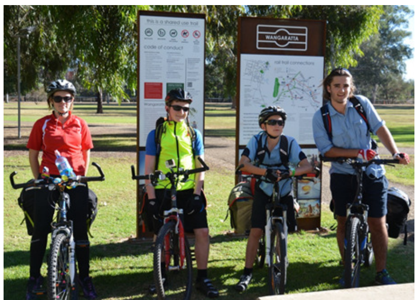
The End of the Trail!