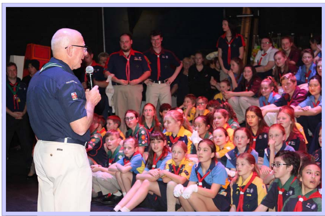
His Excellency General The Honourable David John Hurley Governor of NSW addresses the cast at the conclusion of the Opening Night performance of CGS

Numbers are limited so reserve your place now by completing the E1 on the Activities page of the GWS website and submitting it to the Region Office before 6 th August 2016