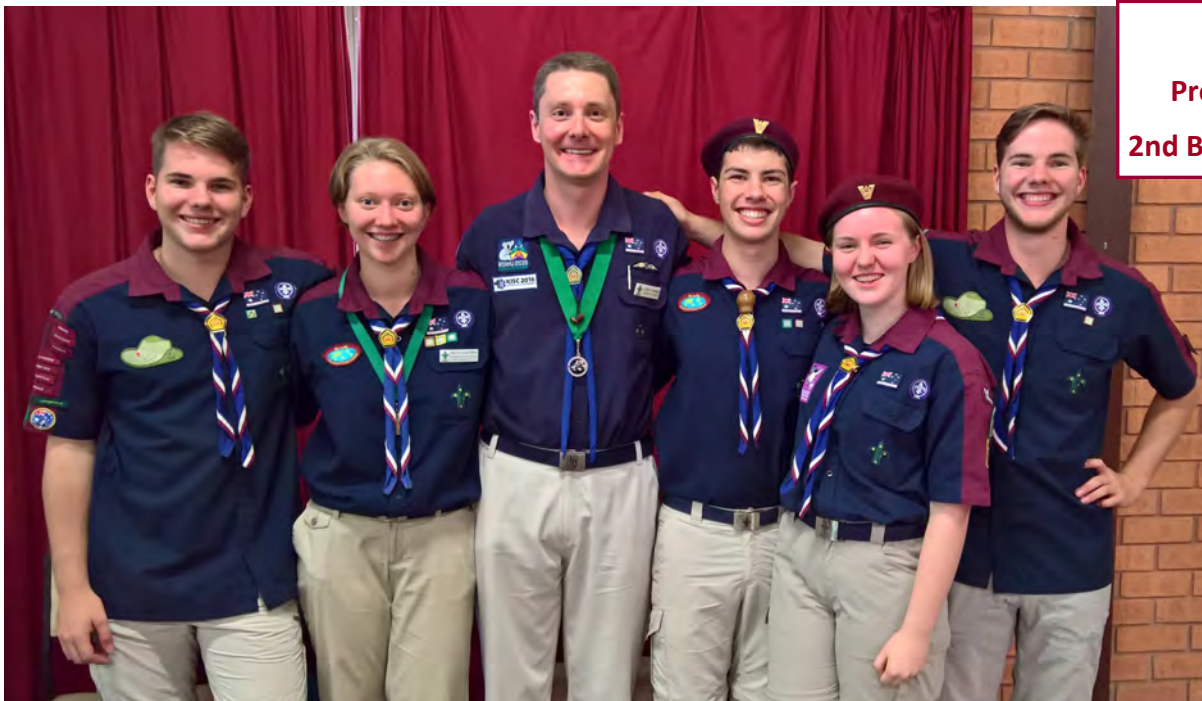
QSA Presentation 2nd Baulkham Hills

Email: venturers@greaterwestscouts.com.au