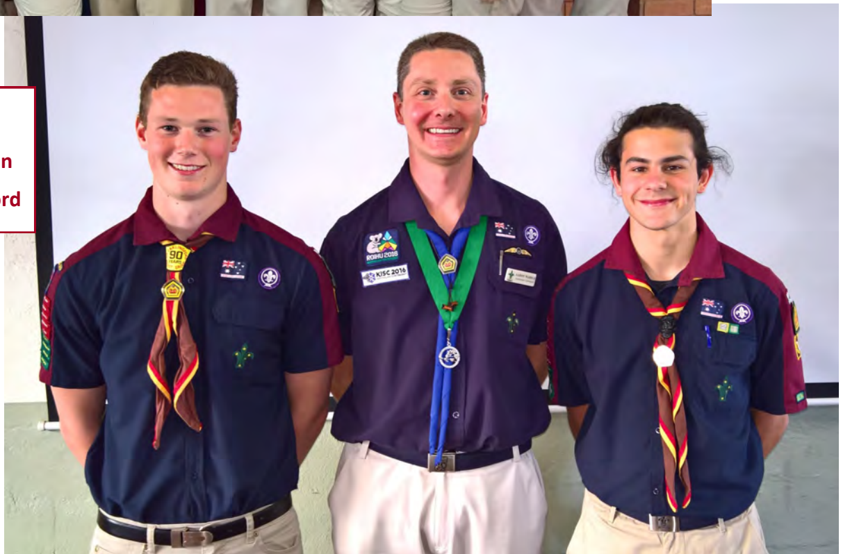
QSA Presentation 1st Carlingford