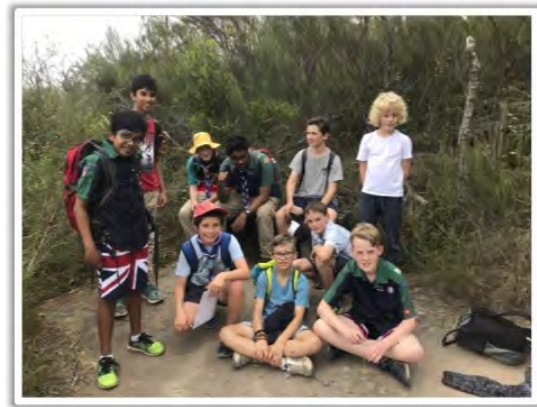
2 nd Baulkham Hills Scouts on the track.