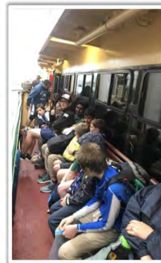
The Manly Ferry home.