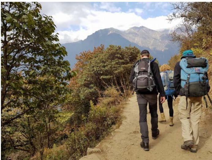
1st Westmead's Everest Base Camp trek

Since we last spoke, summer has started off with a bang. Westmead Rovers ventured to Nepal and managed to complete the Everest Base Camp Trek and come back in one piece! BRAVO!