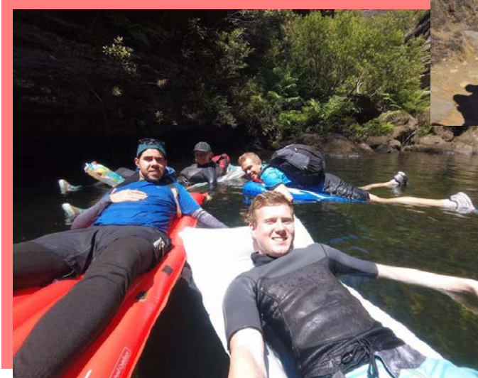
2nd Baulkham Hills Outdoor Crew