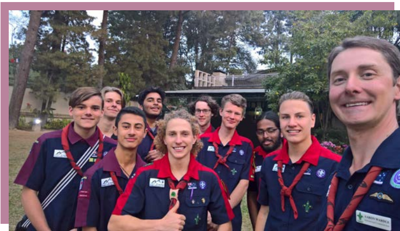
1st Westmead Nepal Trek