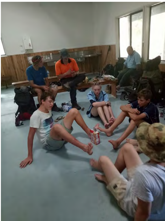
Glossodia Venturers cooling off after hiking into Region Camp at Kariong.

Term has restarted and I am pleased to see good things happening with programming and award scheme progress. We started term with a huge turnout at Region Venturer Council in week 2. In spite of the cancellation of Roventure, the youth reaffirmed the social camp at Scout Camp Kariong should proceed. I was delighted to see the high proportion of Units who decided to walk in from Wondabyne on one of the hottest days of the season.