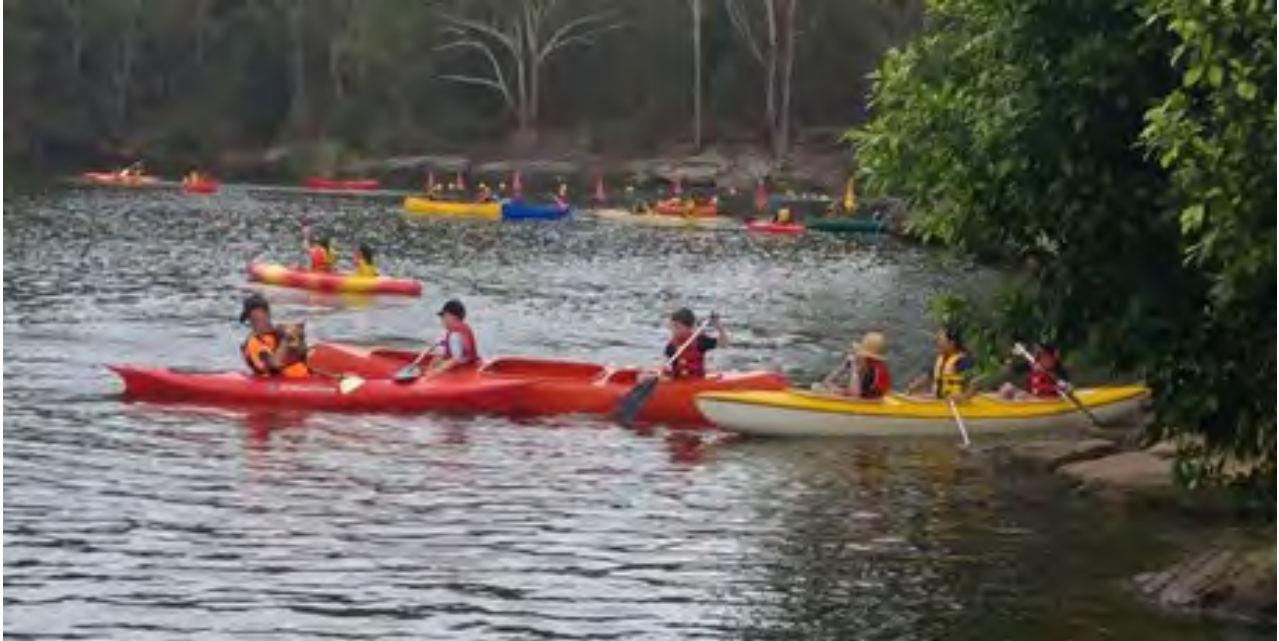
Joey and Cub Fun Day on the Water 2018