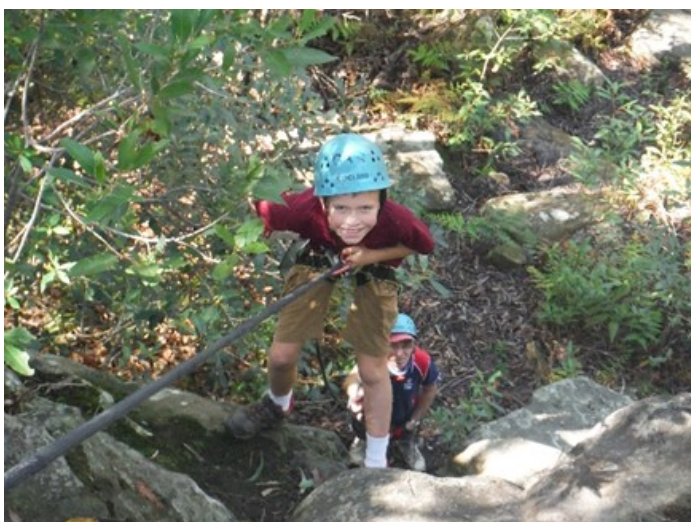
Not the biggest of abseils, but it is learning by doing!

In learning the basic skills in Abseiling, it almost requires a 1:1 ratio between leaders and participants. To better achieve this, we ran both a morning and an afternoon session with about 10 participants in each. Worked really well.