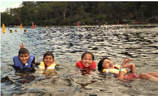
Great day for a bit of a splash as well.

What a great day that was had at the Joey Cub Water Fun day at Lake Parramatta. It was certainly an early start but with over forty canoes on the water along with 380 registered participants, it was going to be a busy day. But what a pleasure to be part of the action.