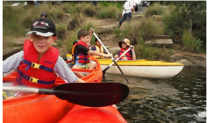
Cubs & Joeys heading off in all directions.