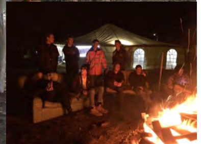
BRAVO to all Rovers who attended the event and who supported their fellow sections.