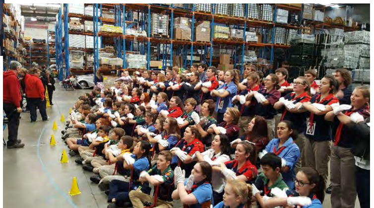
Putting the finishing touches to our 49 th Season!