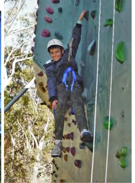
Is that who I think it is...?

Of course, I must mention the onsite climbing wall, while under my watchful eye, was very efficiently run by the Venturers. A great effort by all involved over the whole weekend.