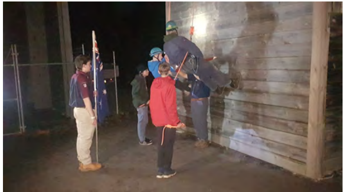
Late night Investiture Kings Langley style!