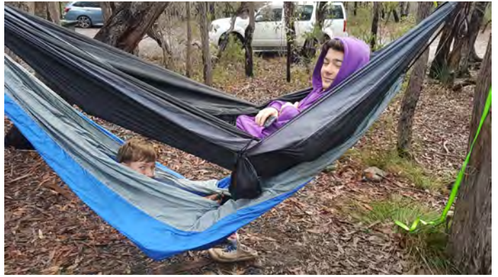
Venturers hard at work at the Caving Base!