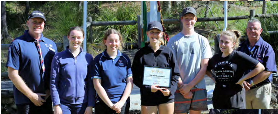
1st Ermington Winners of The Golden Wattle Award for the most enthusiastic team who threw all that they had into the competition!