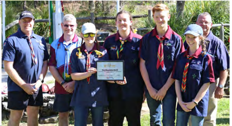
Order of the Golden Phoenix from 1st Dubbo and 3rd Orange Winners of The Mountain Devil Award for Best Out of Region Team