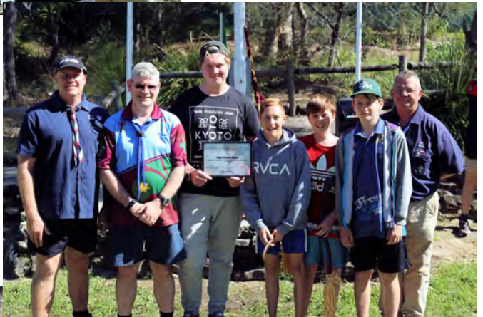
Fully Sic Broomstick from 1st/2nd Blacktown Winners of The Silver Fern Award The first team to complete the challenge of Waratah 2018