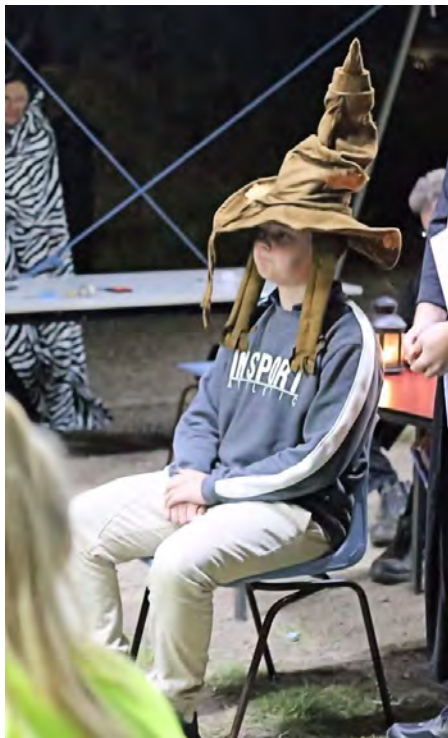
The Waratah Sorting Hat Ceremony on Friday night.