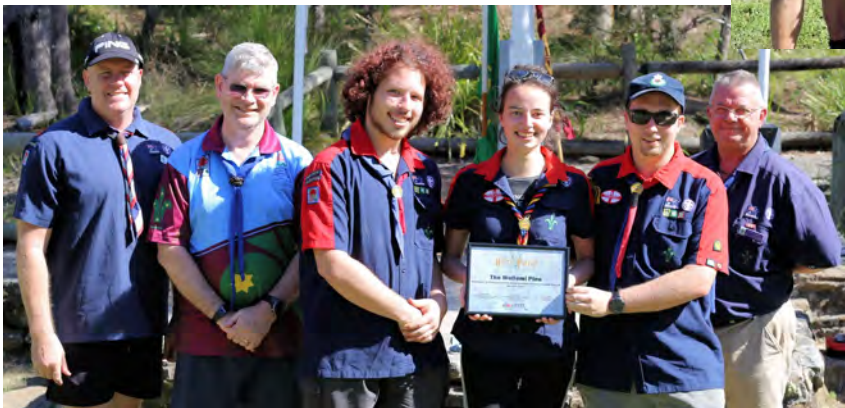
Blaxland Rover Crew Kalangadoo Winners of The Wollemi Pine Award for Best Waratah Challenge Base 'Quidditch'