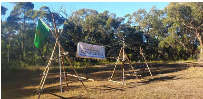
Best Traditional Gateway - 1st Balcombe Heights