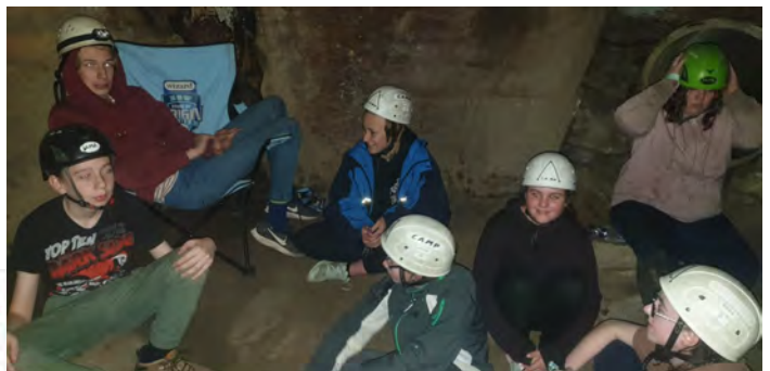
Telling stories in a dark cave