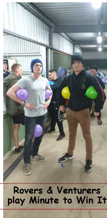
Rovers & Venturers play Minute to Win It