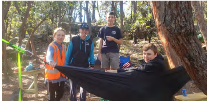
Hard at work at the caves!