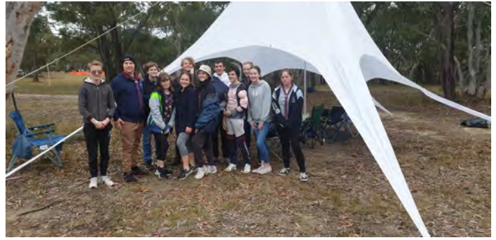
1st KL Venturers' Base