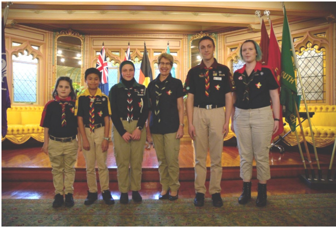
The newly invested Chief Scout Margaret Beazley AO, QC with all Scout Youth section representatives