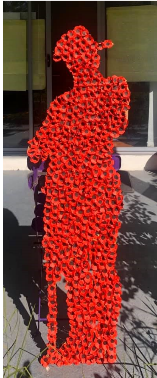
2nd Kings Langley Venturers' amazing artwork!