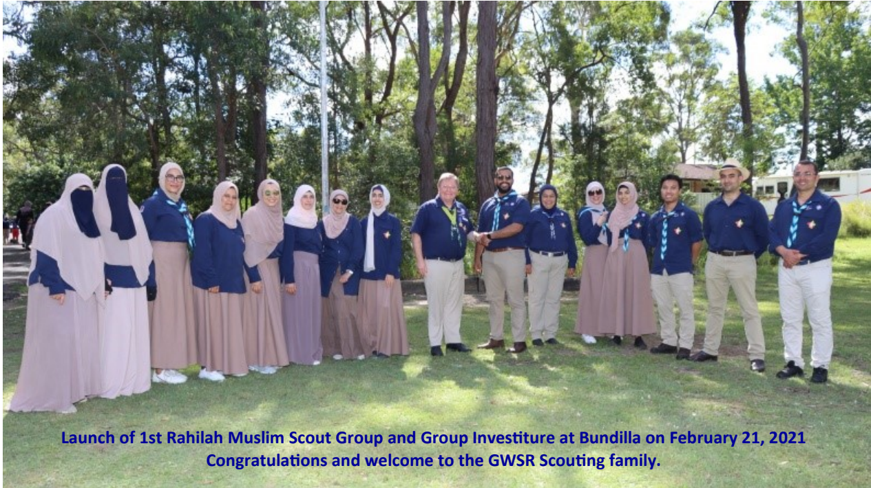
Launch of 1st Rahilah Muslim Scout Group and Group Investiture at Bundilla on February 21, 2021 Congratulations and welcome to the GWSR Scouting family.