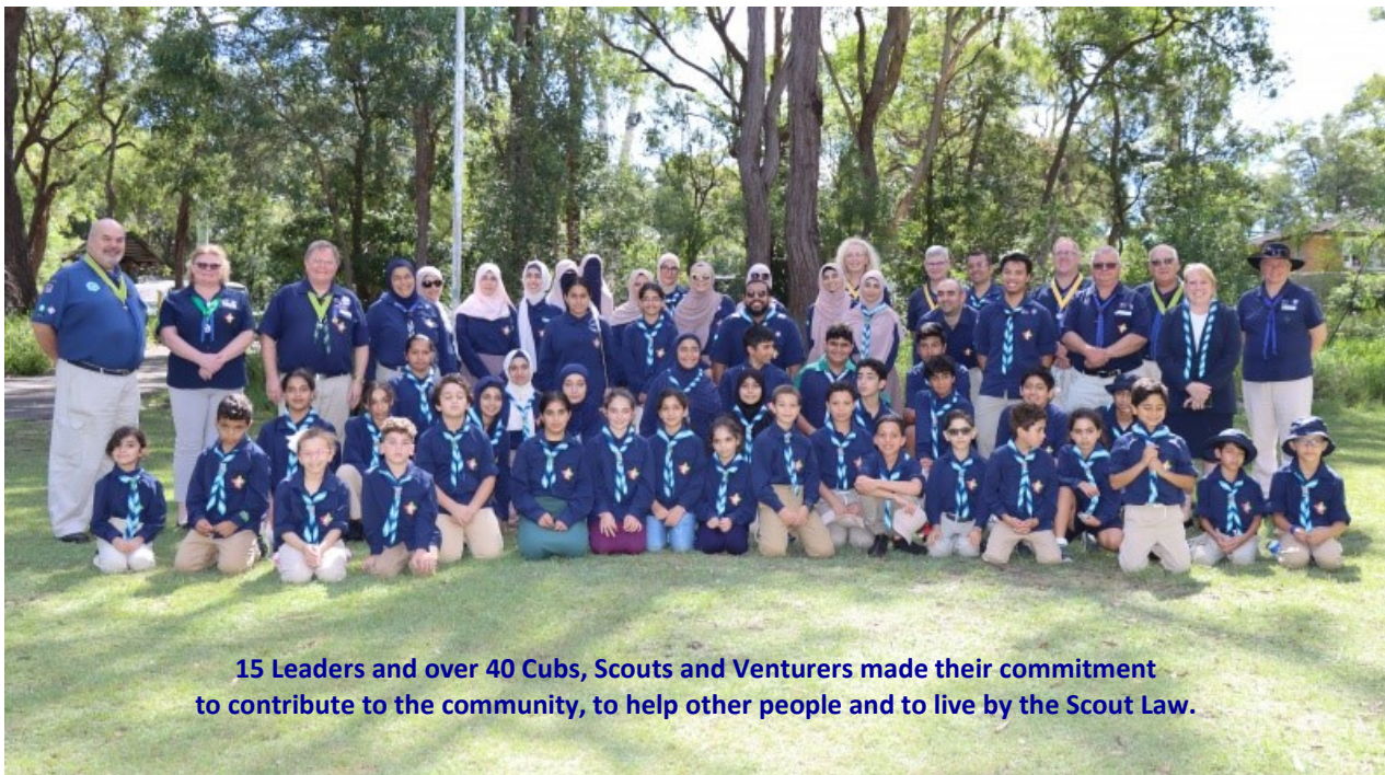
15 Leaders and over 40 Cubs, Scouts and Venturers made their commitment to contribute to the community, to help other people and to live by the Scout Law.