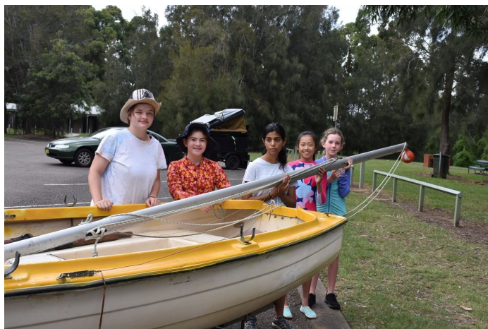
Girls participating in our recent sailing workshop at Lake Chipping Norton