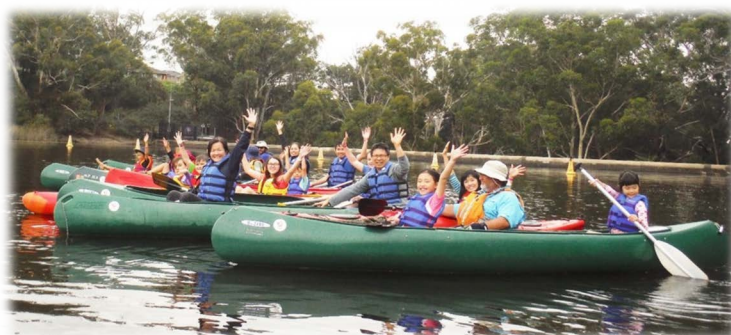
So, who is having more fun: the adults or the youth...?

Of course, it was not just these people. There were many who contributed to making this time the success it was.