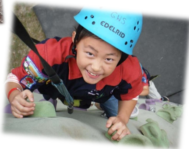
The smile says it all!

Sometimes Government cost cutting can catch you out! Had a recent incident where one of my Activity Leaders was towing a Region trailer and got pulled over for having an unregistered trailer. In fact, this particular trailer was about 6 months out of rego. This required us having to arrange for a Blue Slip and then re-register the trailer, which is all a bit involved.