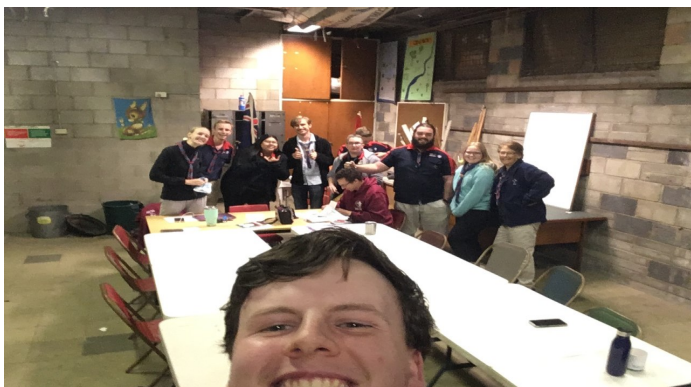
Another year, another great ARP for KL!