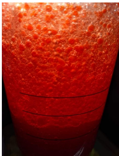
DIY lava lamp, part of many experiments done from home by KL

Kings Langley explored their curious and creative sides early on in August with a science night, followed closely by a Minecraft building competition.