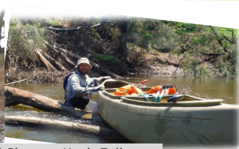
The mighty Lachlan River certainly gave us a few challenges!

Hopefully now, as we start to realise that COVID-19 is going to be something we will all just need to live with, the gates will open up, as far as Adventurous Activities go. Already, I am seeing numerous notifications coming through for an array of great activities happening within the Region.