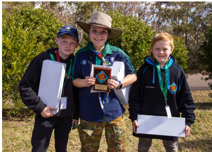
The Delorians - 2nd Northmead

State Rally 2022 has been run and won. GWSR did well with The Delorians - 2nd Northmead taking out 3rd place overall . The Delorians also took out first place in GWS followed in second place by The Itts - 1st Westmead and in third place The Night Owls - 1st Balcombe Heights .