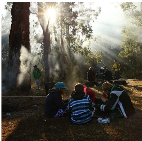
State Rally