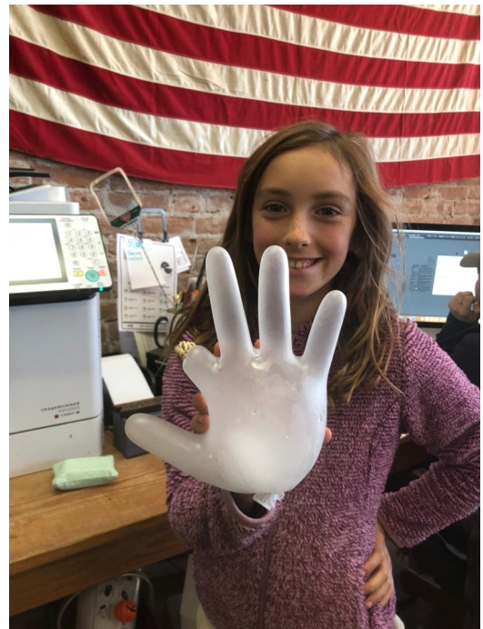
CO 2 in a plastic glove