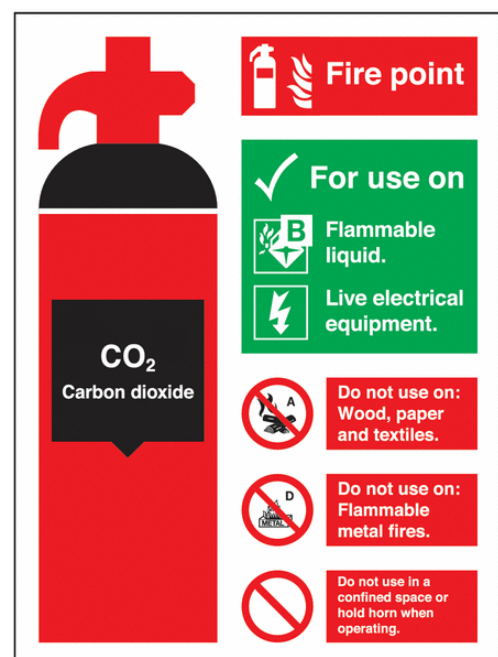
CO 2 Fire Extinguisher