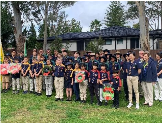
ANZAC Day - 2nd Castle Hill Scout Group