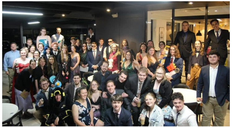
Another successful Formal Regressive Macca's Dinner organised by Kings Langley Rovers