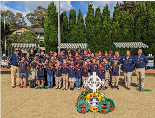
1st/2nd Merrylands & 1st Greystanes @ Club Merrylands on ANZAC Day