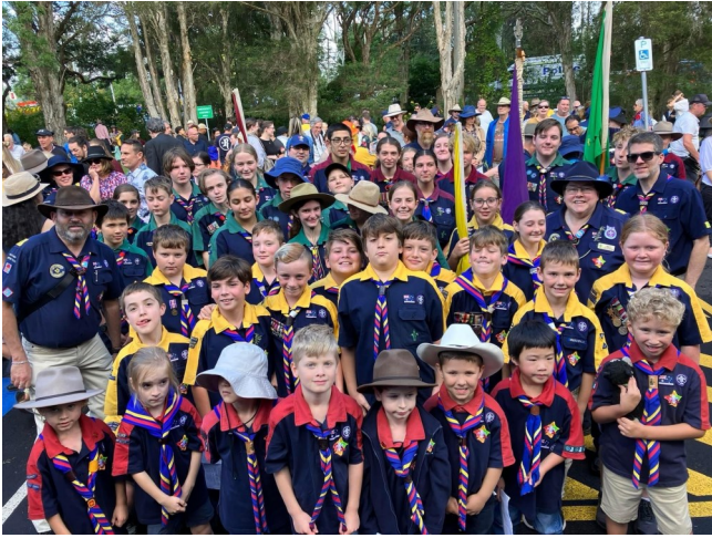
ANZAC Day - 1st Blaxland Scout Group