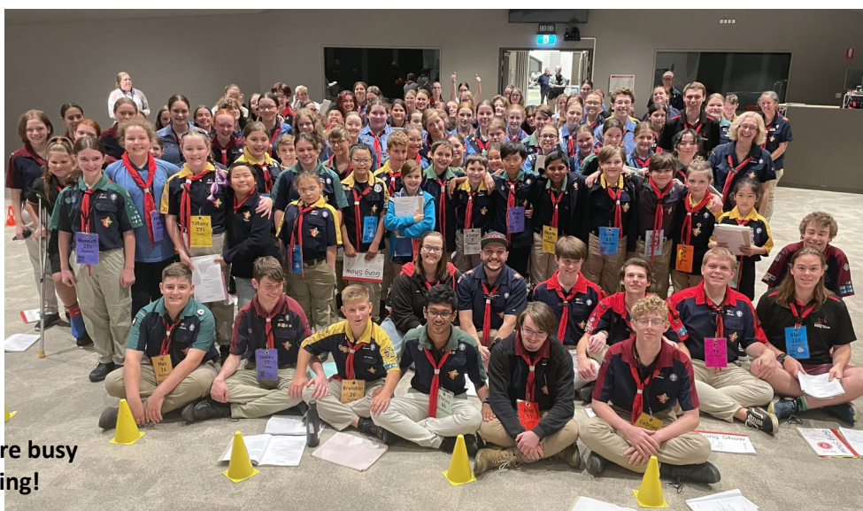
The Gang are busy rehearsing!

Email: boxoffice_riverside@cityofparramatta.nsw.gov.au