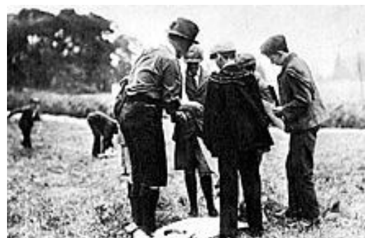
Robert Baden Powell with future scouts.

This day is aligned with the first day of the first Scout camp in 1907 on Brownsea Island, England.