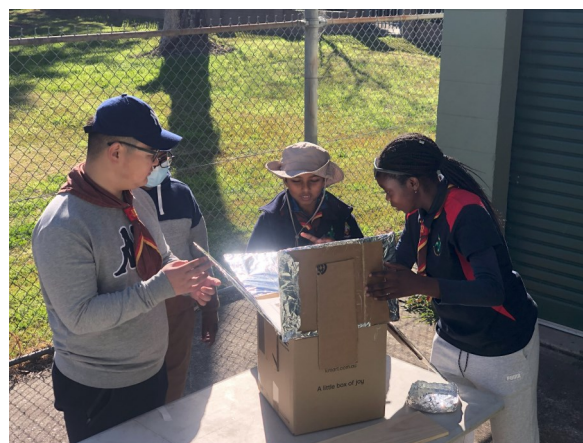
Along the way we achieved an SIA (Stem and Innovation) and the Scouts Go Solar Challenge badges.

We have discussed the improvements we would try next time, they include; gaining access to a solar fan, so we can improve our dehydrator; along with correctly coordinating our sundial so that it can be even more accurate than before. We also want to be able to seal the air better in our solar oven for better results.