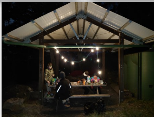
Ruined Castle overnight, July 2023. Clear skies during the day and low temps overnight