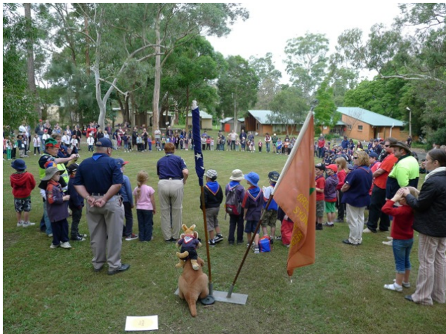
Opening Parade at Joey Scout Fun Day