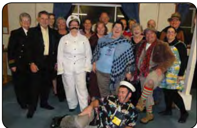
GWSR leaders with SCCS at Palaver's formal dinner